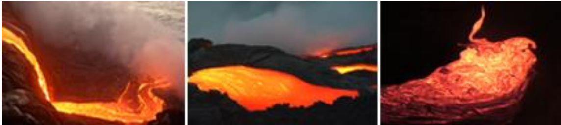
"Lava - Kilauea, Hawaii"