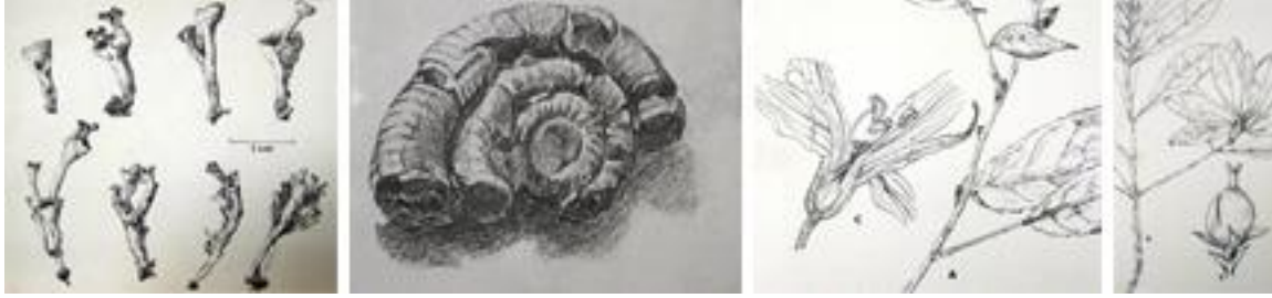
Lichens: Drawn through Microscope