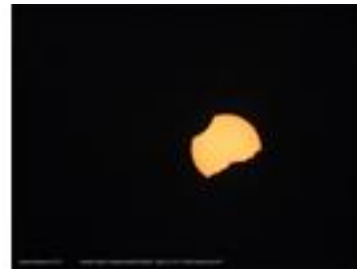
Eclipse Setting behind Sierras