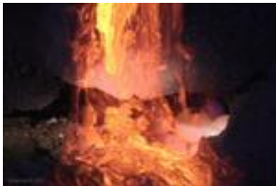
Video/DVD: Egg. Birth. Flow. © 2011