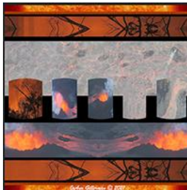
NFT VR: Lava Series

IMMERSIVE TOTAL SOLAR ECLIPSE: 2017-current Virtual Reality/360 Project