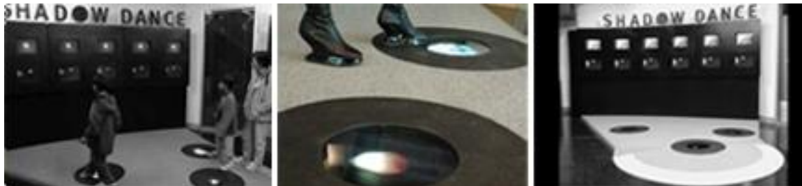
SHADOW DANCE INTERACTIVE ECLIPSE EXHIBIT at Chabot Space and Science Center, Oakland, California