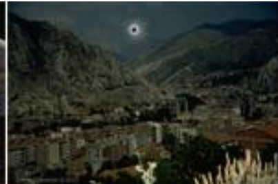
Amasya, Turkey - 1999