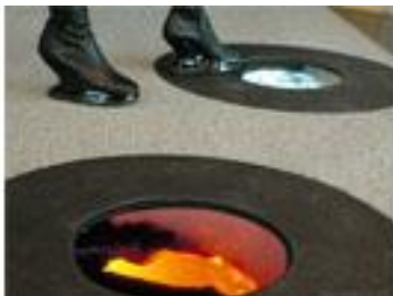
Interactive Glass/Metal Floor Sensors