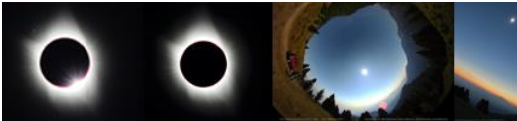
Total Solar Eclipse Aug. 21, 2017 - Mine Hill, Idaho (Fulldome, VR, 360°)

There was a total solar eclipse across United States on August 21, 2017. Near the center line in the path of totality, this eclipse was captured in 4K video, 360° and Virtual Reality (VR) to create immersive eclipse environments for planetarium style projection and Virtual Reality installations. Outreach brings an immersive/VR eclipse experience to underserved communities who might not otherwise have opportunity to experience this natural event.