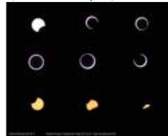
Annular Eclipse Sequence