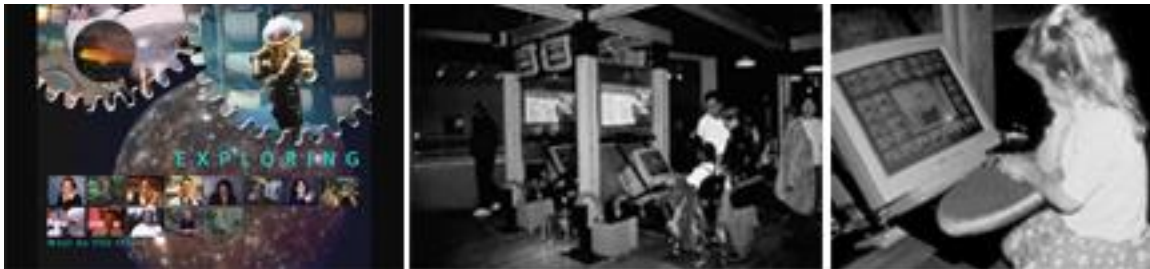
INNOVATION FORUM INTERACTIVE EXHIBIT at The Tech Museum of Innovation, San Jose, California