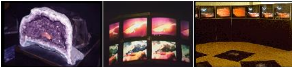
Video Lava Rock Sculpture Steel, Rock, Video (Blasthaus Gallery, SF, CA)