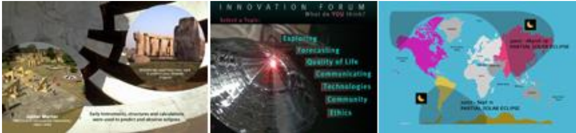
Shadow Dance / History and Tools