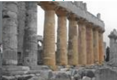
Temple of Zeus