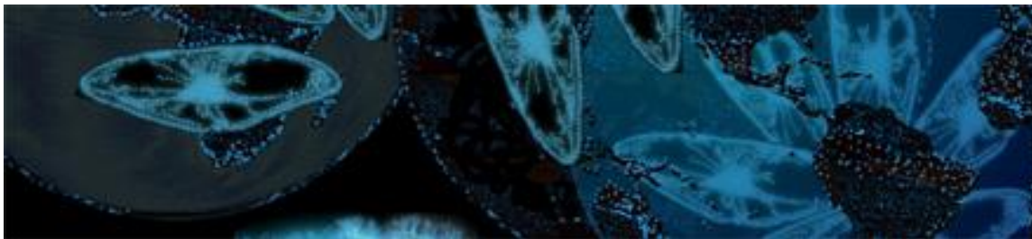
"Circadian Rhythm: Bioluminescent dinoflagellates " Digital Painting - Gillerman © 2018