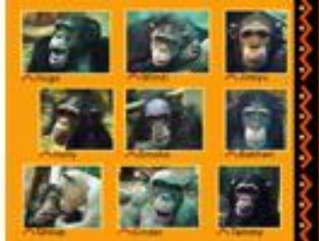
Chimp Finder: Interactive Chimp Bios Touch Screen, Chimp Conservation