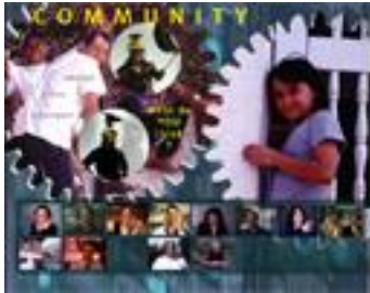
Interactive Innovation Forum Exhibit - UI Screens