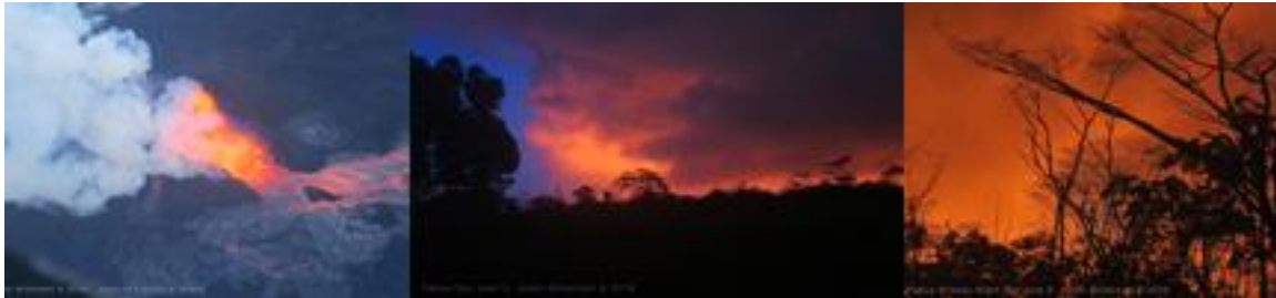
Kilauea Volcano 2018 - Areal 3000' above Fissure 8, Skies of Volcanic Glow around Pahoa, HI

A powerful event of Kilauea Volcano, Hawaii, ended in disaster and contemplation for many who lost homes, land and the uncertainty of their future living on the edge of one of the most active volcanoes in the world. Fissure 8 erupted massive lava flows covering hundreds of homes, roads, damaging a Geothermal Power Plant, and causing thousands to evacuate. Kilauea Summit experienced unprecedented number of earthquakes and large gas/steam eruptions. On-location over decades "Kilauea: Pele's Domain" captures active lava flows on video and Virtual Reality/360 from air, land and sea. Video at an evacuation center in Ke'eau, provides perspective from an indigenous Hawaiian woman, hula dancer and mother of 5 who lost their home to the lava flows, as she talks about Pele reclaiming her land. (Screenings 2019: Sharjah Film Platform, United Arab Emirates; San Pablo Art Gallery, San Pablo, CA; The Dome Studios, Oakland, CA, USA)