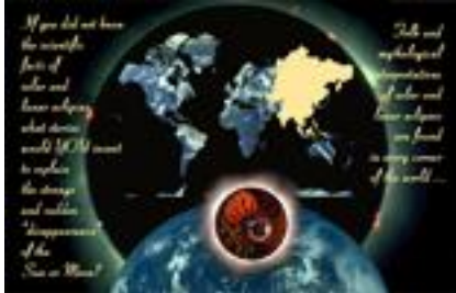
Interactive Map: areas light up for Myths Floor Pad controlled

original artwork, designs and custom content used in exhibits. Eclipse Myths (Dragon, Jaguar, KalaRau) images & animation are hand drawn and composited on computer. © JoAnn Gillerman