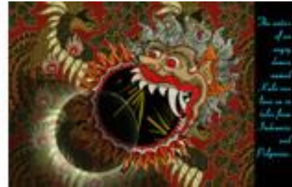
Multi-user Interactive: KalaRau Eclipse Myth