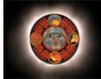
Intijiwana - Interactive CD/DVD