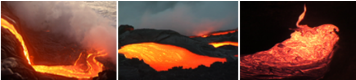
“Lava - Kilauea, Hawaii”