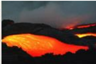
Lava Bench - Kilauea, Hawaii - 2000