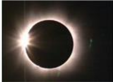
Diamond Ring - Turkey 1999