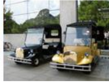
Electric Cars, China 2008