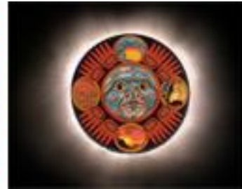
Intjiwana - Interactive CD/DVD