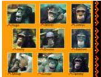
Chimp Finder: Interactive Chimp Bios Touch Screen, Chimp Conservation