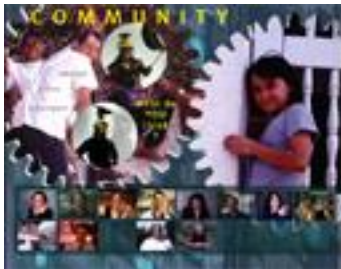
Interactive Innovation Forum Exhibit - UI Screens