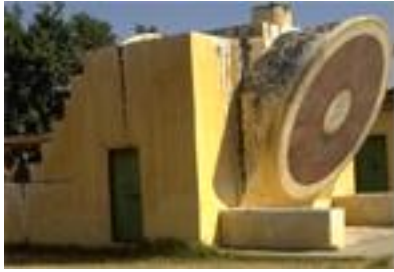
Sundial (built 1724), Jantar Mantar, India