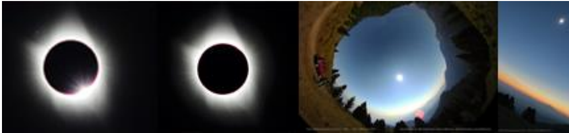
Total Solar Eclipse Aug. 21, 2017 - Mine Hill, Idaho (Fulldome, VR, 360°)

There was a total solar eclipse on August 21, 2017. In Eastern Idaho near the center line in the path of totality, I captured video of this eclipse in 4K, 360° and Virtual Reality (VR) to create immersive eclipse environments. This immersive eclipse environment project will create a large scale fulldome planetarium style projection and more intimate virtual reality. An outreach component will bring an immerisive eclipse experience to underserved communities who might not otherwise have opportunity to experience this natural event. (currently in production 2018)