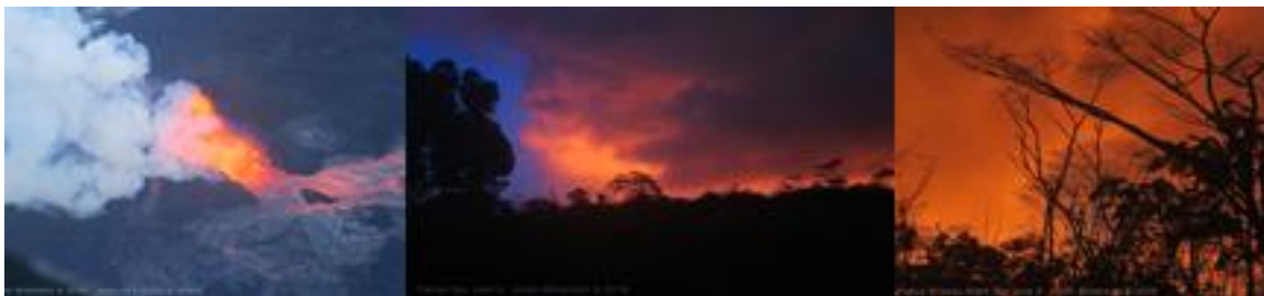
Kilauea Volcano 2018 - Areal 3000' above Fissure 8, Skies of Volcanic Glows around Pahoa

What started and continues as an amazing powerful phenomena of Kilauea in Hawaii, has ended in disaster for many people who have lost homes, land and the uncertainty of their future living on the edge of one of the most active volcanoes in the world. Fissure 8 has been pumping voluminous amounts of lava and the massive flows have covered hundreds of homes, closed roads, damanged the Geothermal Power Plant, and caused thousands to evacuate. At Kilauea Summit, there has been an unprecedented number of earthquakes and eruptions of gas/steam plumes, some over 6 miles high. And ... no one knows what's next. (on-location aerial video and VR of fissures and lava flows, interviews at evacuation center.)