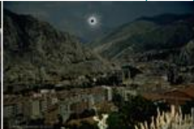
Amasya, Turkey - 1999