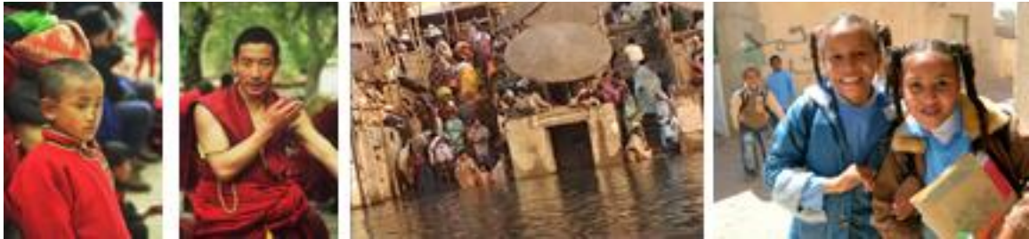
Tibet Monastery 2001