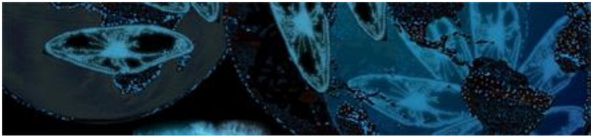
“Circadian Rhythm Series: Bioluminescent Algae” Digital Painting - Gillerman © 201