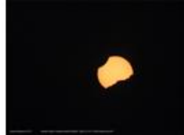
Eclipse Setting behind Sierras