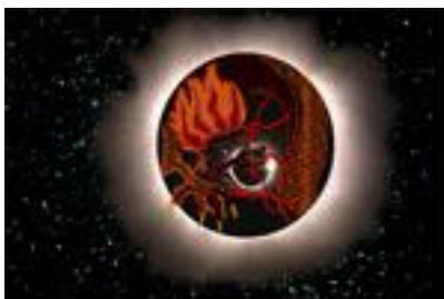
Chinese Eclipse Myth - Digital Drawing