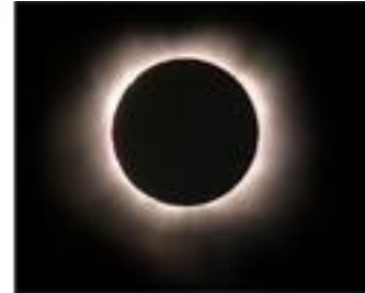
Amasya, Turkey, 1999