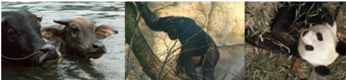
Water Buffalo, Li River, China