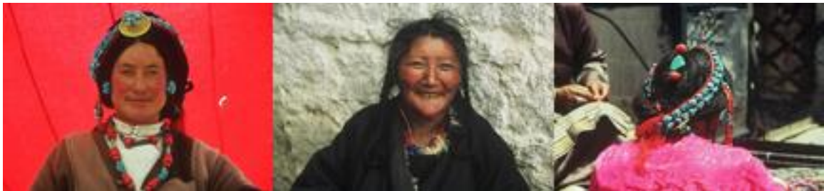
Three Women - Tibet 2001