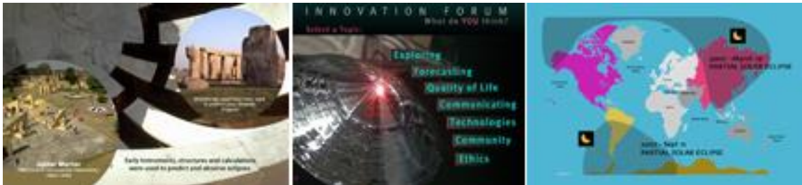
Floor Pad Controlled "Eclipse Tools"