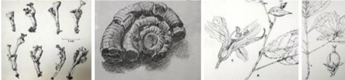
Lichens: Drawn through Microscope