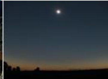
Siberia, Russia - 2008