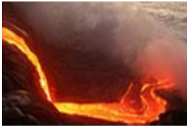
Lava Falls - Kilauea, Hawaii - 2009