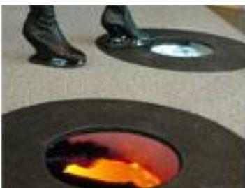
Interactive Glass/Metal Floor Sensors