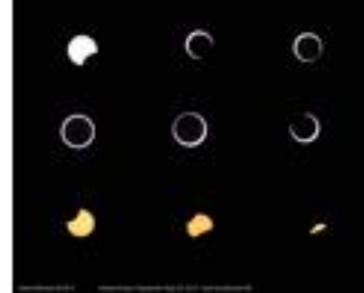
Annular Eclipse Sequence