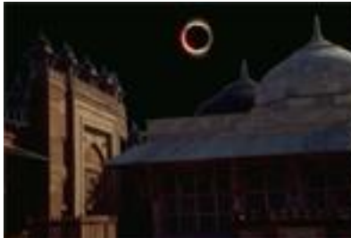
Fatepur Sikri, India - 1995