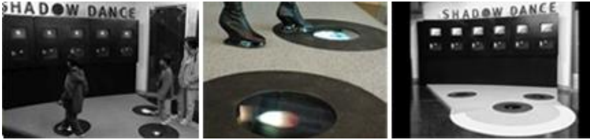
SHADOW DANCE INTERACTIVE ECLIPSE EXHIBIT at Chabot Space and Science Center, Oakland, California