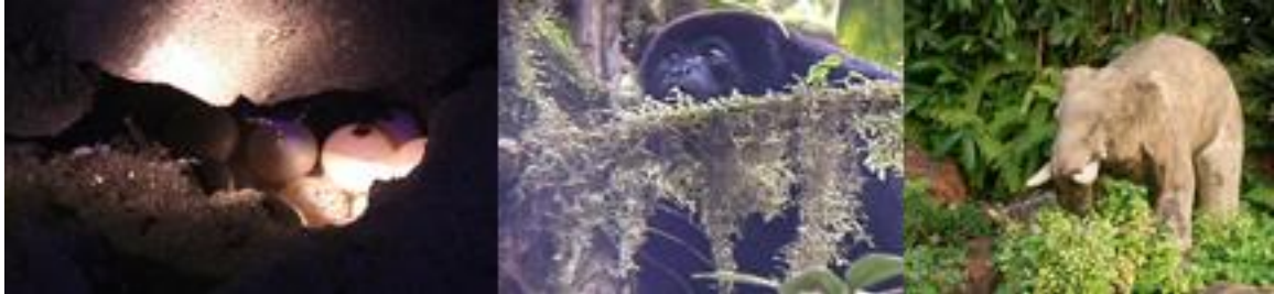
Video: Ridley Sea Turtle lays 60 eggs and Howler Monkey, Costa Rica