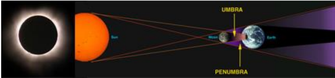
"You have created a ... TOTAL SOLAR ECLIPSE"