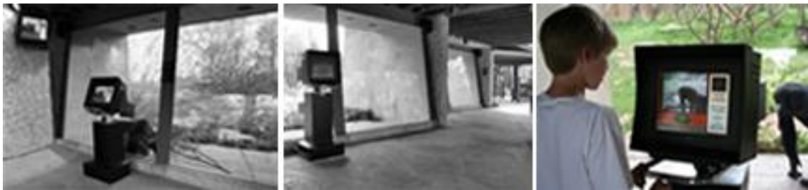
LIAISON/CHIMP FINDER INTERACTIVE EXHIBIT at the Saint Louis Zoo, Saint Louis, Missouri