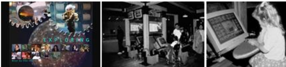
INNOVATION FORUM INTERACTIVE EXHIBIT at The Tech Museum of Innovation, San Jose, California