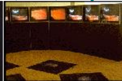
10 Display Installation Floor Pad controlled