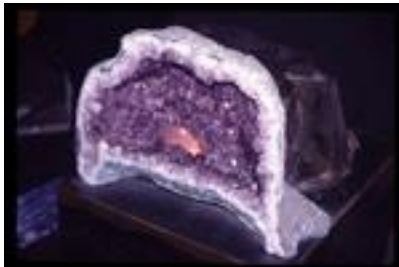
VideoLava Rock Sculpture Steel Rock, Video