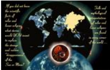
Interactive Map: areas light up for Myths Floor Pad controlled

original artwork, designs and custom content used in exhibits. Eclipse Myths (Dragon, Jaguar, KalaRau) images & animation are hand drawn and composited on computer. © JoAnn Gillerman