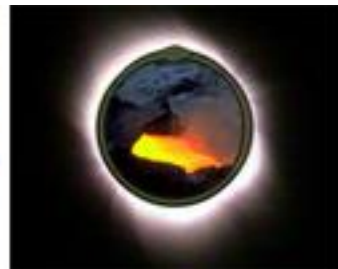
Volcanic Eclipse © '94