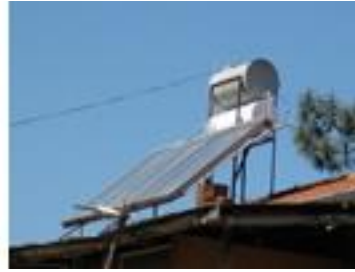
Solar Water Heater, Turkey 2010