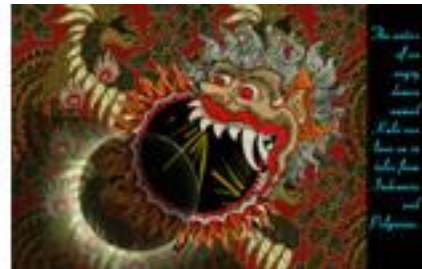
Multi-user Interactive: KalaRau Eclipse My