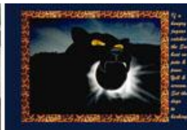
Bolivia Eclipse Myth Animation