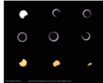
Annular Eclipse Sequence