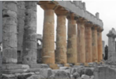
Temple of Zeus