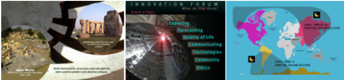
Shadow Dance / History and Tools