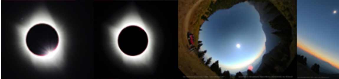
Total Solar Eclipse Aug. 21, 2017 - Mine Hill, Idaho (Fulldome, VR, 360°)

There was a total solar eclipse across United States on August 21, 2017. In Eastern Idaho near the center line in the path of totality, I captured video of this eclipse in 4K, 360° and Virtual Reality (VR) to create immersive eclipse environments. The immersive eclipse environment will create a large scale fulldome planetarium style projection and more intimate virtual reality installation. Outreach brings an immersive/VR eclipse experience to underserved communities who might not otherwise have opportunity to experience this natural event. (in production 2018-2019)