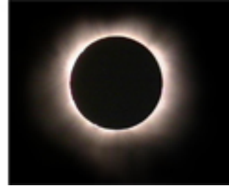
Amasya, Turkey, 1999