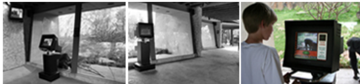
LIAISON/CHIMP FINDER INTERACTIVE EXHIBIT at the Saint Louis Zoo, Saint Louis, Missouri