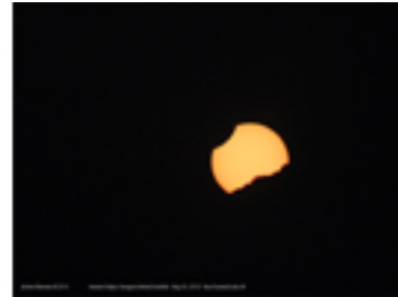
Eclipse Setting behind Sierras