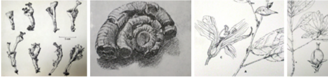
Lichens: Drawn through Microscope