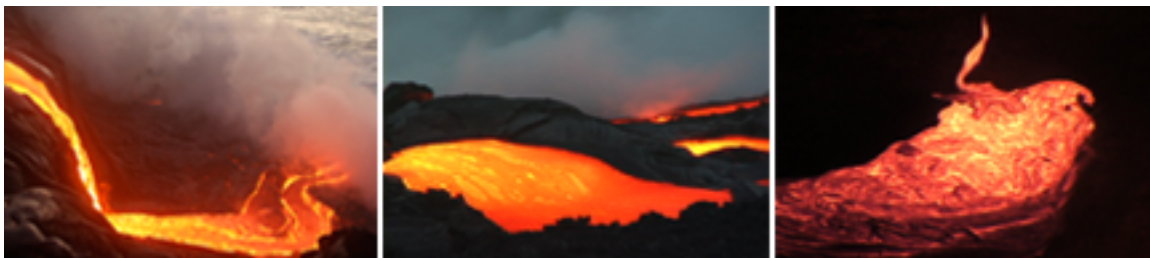
"Lava - Kilauea, Hawaii" Video and Photos - Gillerman © 2016 https://www.joanngillerman.com