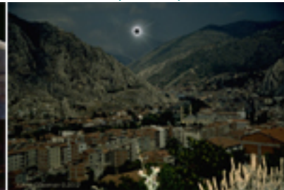
Amasya, Turkey - 1999