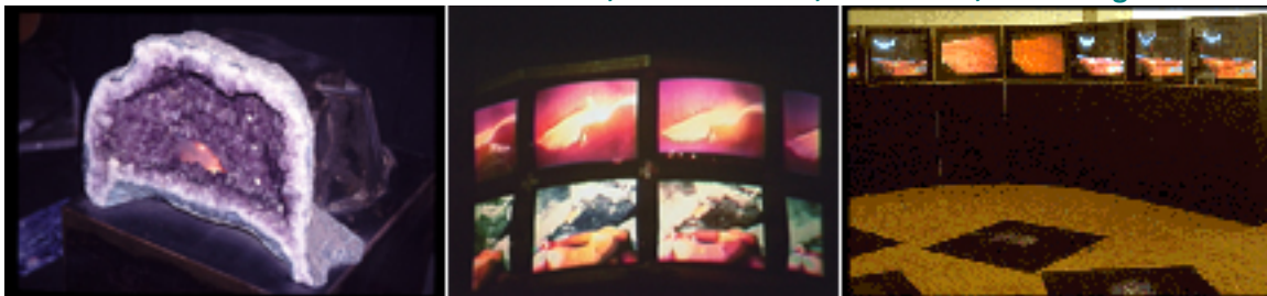
Video Lava Rock Sculpture Steel, Rock, Video (Blasthaus Gallery, SF, CA)