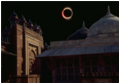
Fatepur Sikri, India - 1995