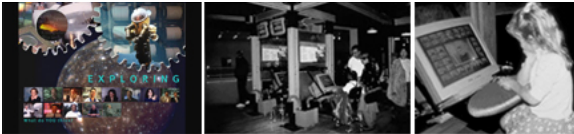
INNOVATION FORUM INTERACTIVE EXHIBIT at The Tech Museum of Innovation, San Jose, California