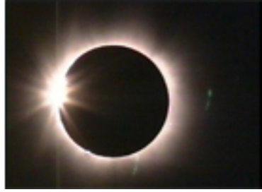
Diamond Ring - Turkey 1999