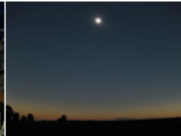
Siberia, Russia - 2008